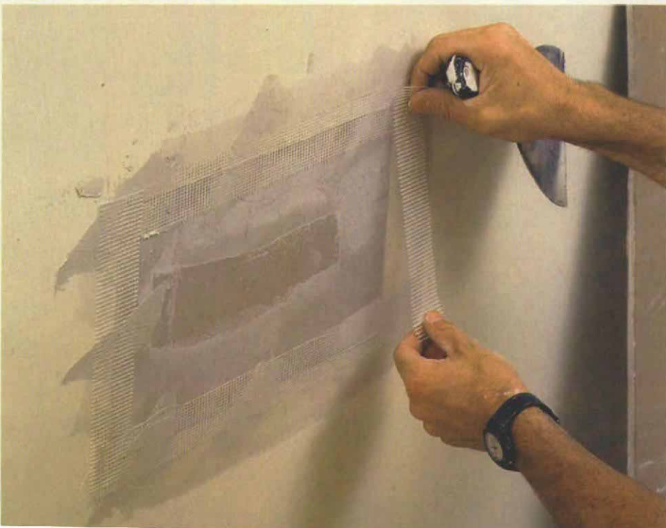
Spread a thin layer of compound over the seams and apply mesh or paper tape.