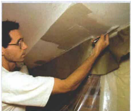
Apply compound to seams; use paper tape and three coats of compound.

Drywall saturated with water may come loose and sag. It will have to dry thoroughly before it can be reattached. The sagging areas will be difficult to reattach when dry because the drywall can take on a new shape. I can sometimes fix sags before the drywall dries out by supporting it with a T-support or temporary furring strips fastened to the framing. It's also a good idea to remove and dry out any wet insulation.