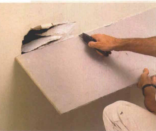
Make a square or rectangular patch slightly larger than the damaged area.

Check out a video clip of repairing drywall on our Web site at finehomebuilding.com .