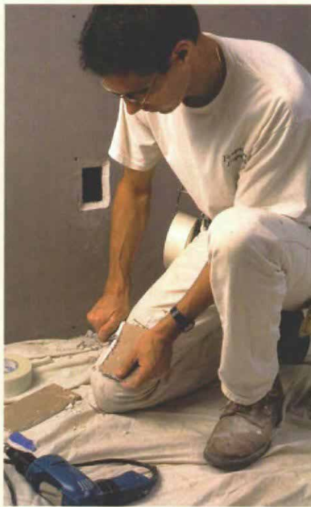
Bevel edges of the wall opening , then cut a matching piece and bevel its edges.

I adjust the fit of the patch with a utility knife until it fits snugly into place. It works best when the patch sinks below the wall plane, leaving room for a thin layer of joint compound. I spread a generous layer of joint compound onto the edges of the opening (or the patch) and press the patch into place. Then I cover the seams with mesh or paper tape, and two or three coats of compound. Sand after the last coat.