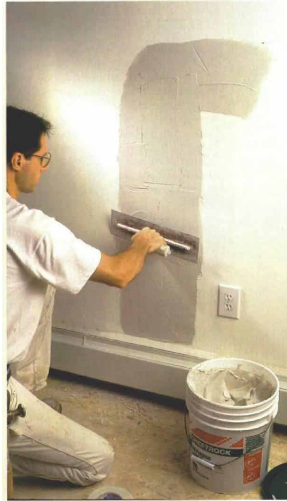
Apply three thin coats of compound, feathering it into the rest of the wall.