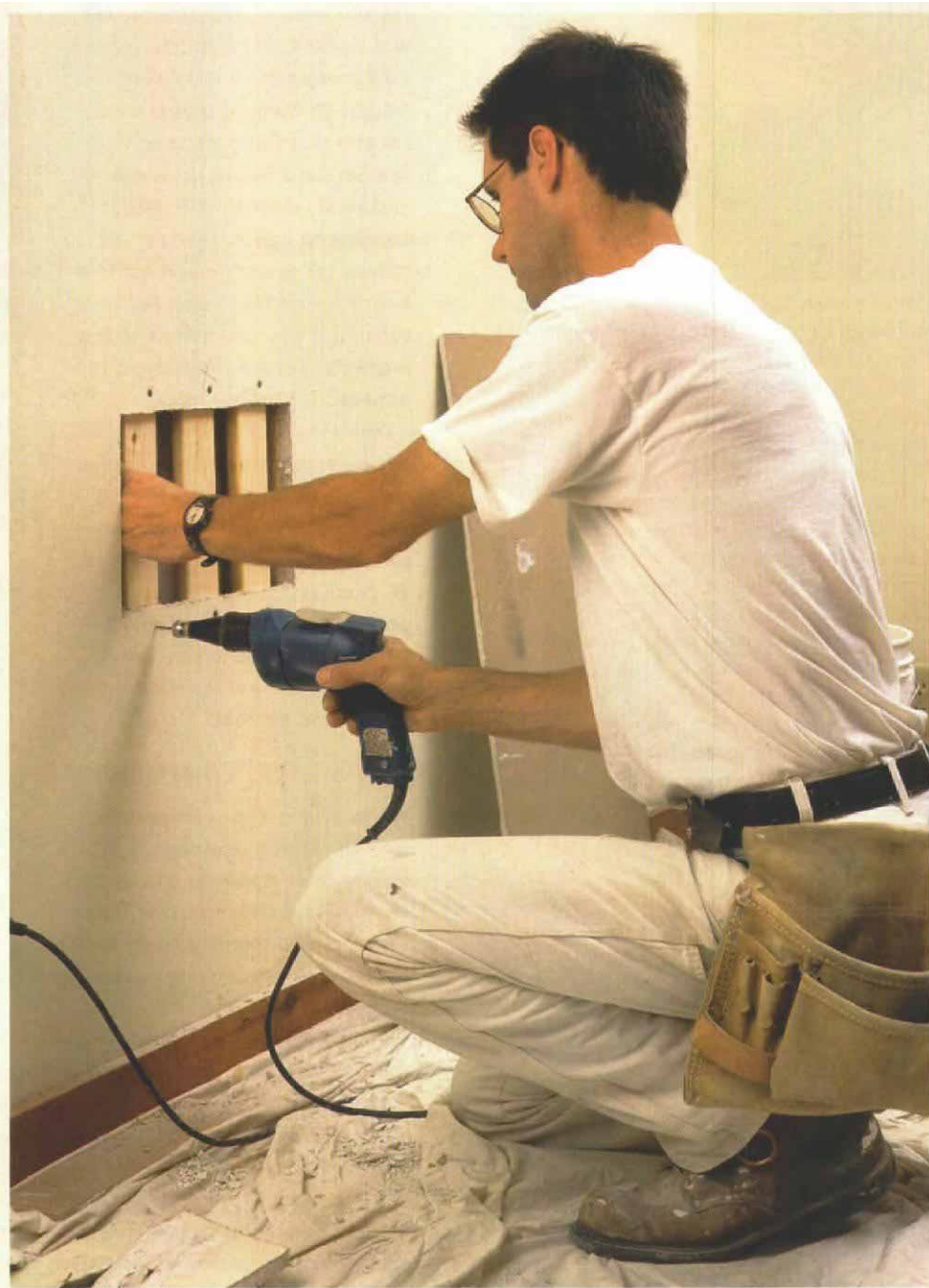
Furring strips of 1x2 material will strengthen the repair considerably. Strips should be 6 in. longer than the opening and fastened at both ends with drywall screws.