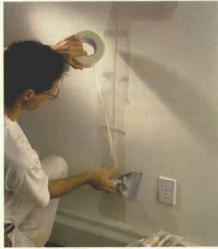
Fill groove with joint compound and apply self-adhering tape over the crack.