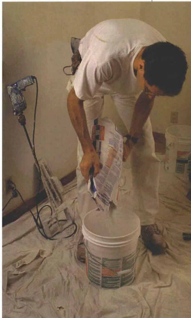
Setting-type compounds, which harden quickly, are great for repair work.