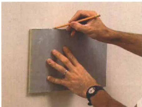
Hold the patch over the damaged area and trace its outline onto the wall.