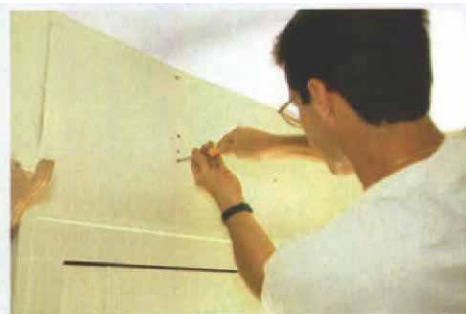
Refasten drywall to underlying framing near the popped nail or screw.

Covering the dimples is easy. If the paper surface of the drywall has not been damaged, just fill the depression with three thin coats of joint compound, letting the compound dry between coats, followed by light sanding with