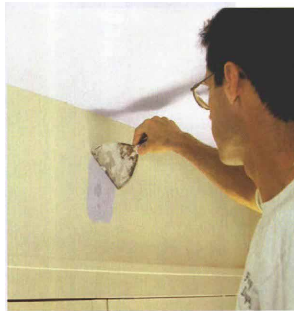
Three thin coats of compound fill dimples, but use tape if surface is damaged.

150-grit sandpaper. If the paper has torn or if the core of the drywall is damaged, it's best to remove all loose material, fill the hole with joint compound and then cover the area with fiberglass-mesh tape. (You can use paper tape, but I prefer self-adhering mesh tape.) This approach also works for any hole 2 in. wide or less.