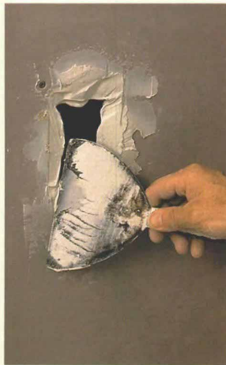
Add joint compound to the opening or the patch, then press patch into place.