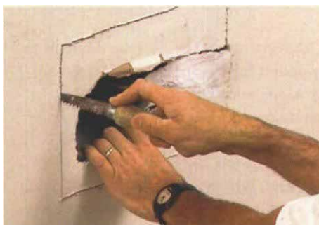
With a drywall saw , cut along the pencil line, then test the patch until it fits.