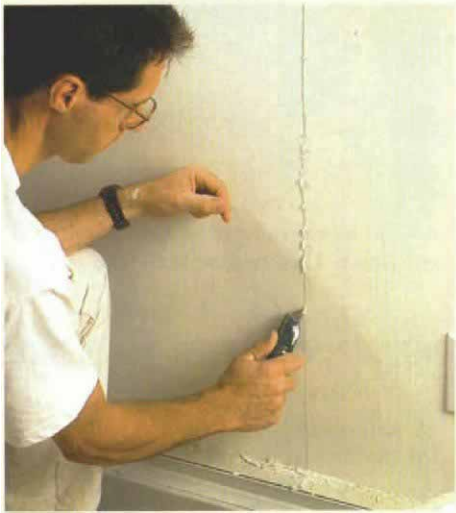
Chip away loose material and cut a V-shaped groove along length of crack.

enough. The first step, as in all repairs, is to remove any loose material with a putty knife or utility knife. I then cut a V-groove along the crack, opening it up about 1/2 in. and going almost completely through the panel to the paper on the back. I fill the void with joint compound (for more about choosing joint compound, see sidebar p. 67) and cover it with mesh or paper tape. Then I smooth the area with two or three coats of joint compound, blending it into the surrounding area and lightly sanding after the last coat. I'm careful to let the joint compound dry between coats.