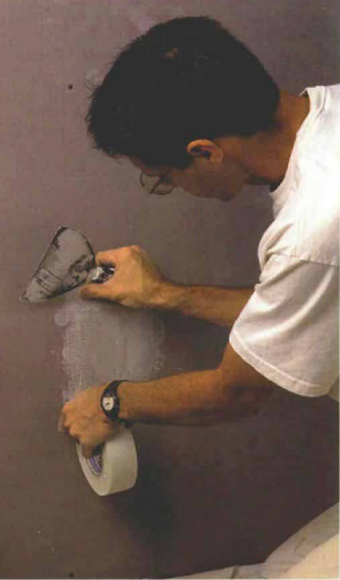
Cover seams with mesh or paper tape, followed by three coats of compound.

usually refasten it to the framing with drywall screws. Next, I cover the seams with paper or mesh tape and apply two or three coats of joint compound.